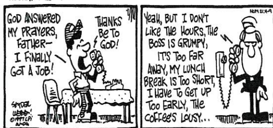
TRUMPET OF THE CROSS