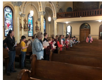
St. Boniface—Stuart 3rd—6th Grades Stations of the Cross and Rosary