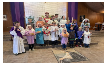
Living Stations @ St. Mary's—Spencer